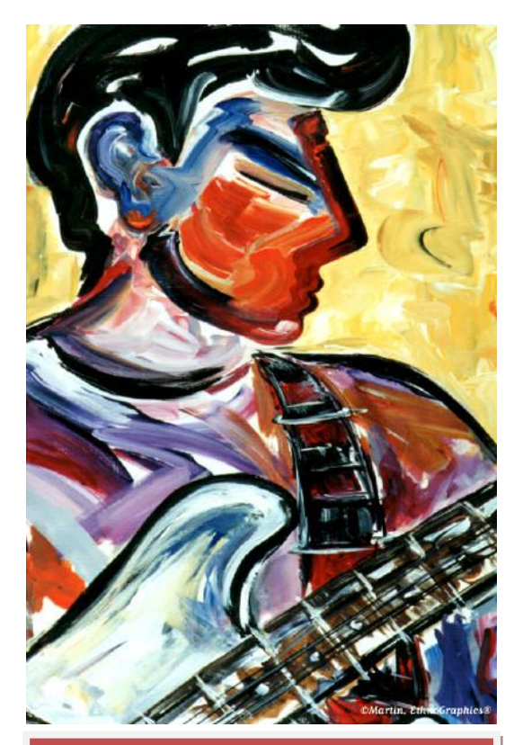
For calendar of events & live music, go to www.presidioyachtclub.org.

Best of all is a recent note from the Park Service to the Air Force stating that they are willing to extend our lease to Sept of 2011. Although this is hardly a long term lease, it is indicative of progress. I humbly submit that we, like the economy, have passed through our low water mark. Green shoots indeed!