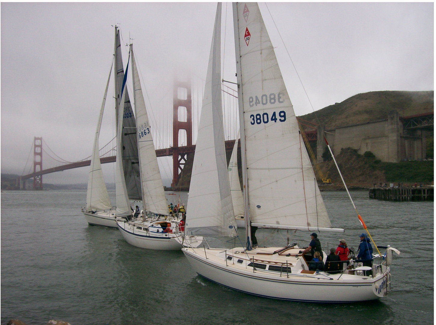
The PYC racing fleet taking off from the starting line. (Not the America's Cup, but being IN a race can be more fun than watching one.) [John Cashman]