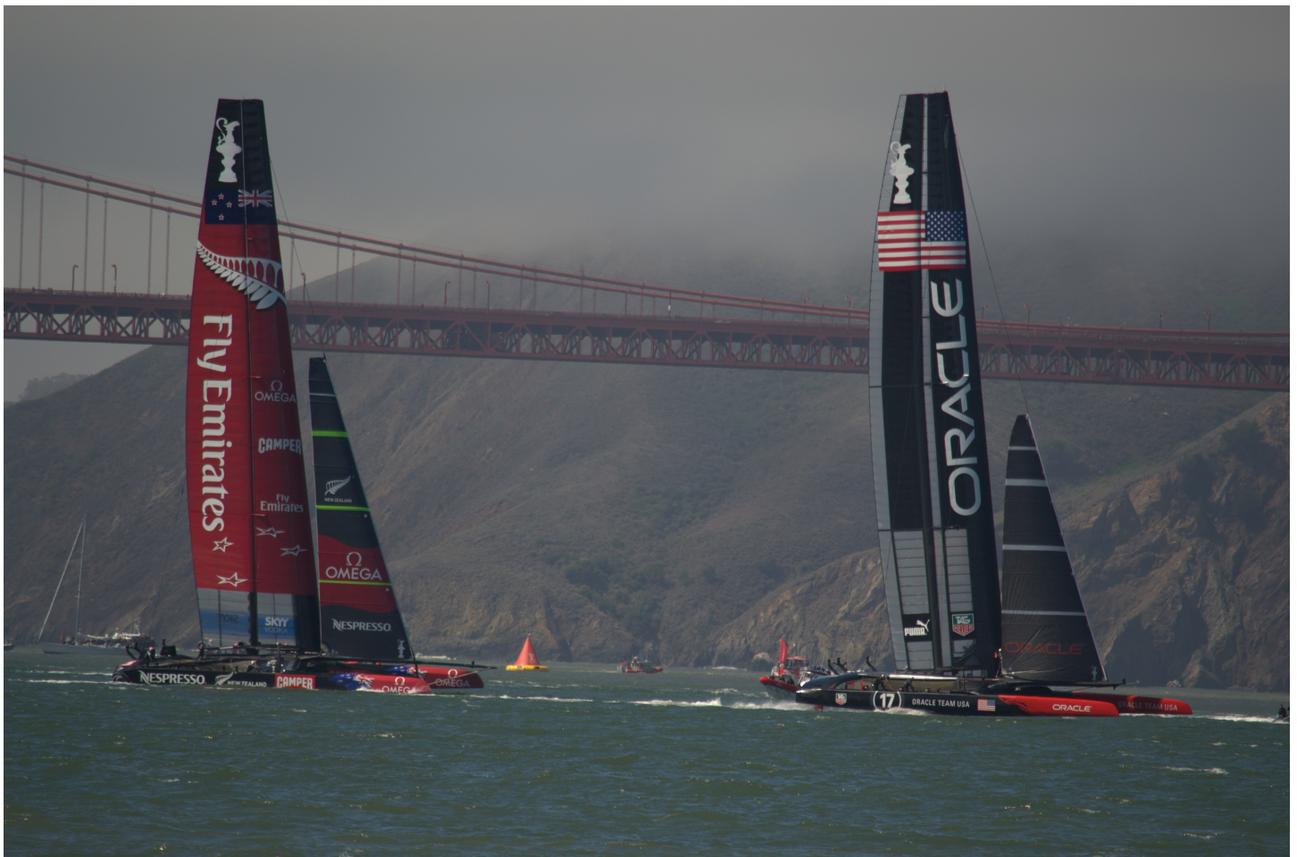
Team Oracle USA leading Team Emirates New Zealand.

By now you should have received a ballot in the mail. This may be new to you as usually we elect the next Council and Bridge by a show of hands during the General Membership Meeting. However, this year two candidates have successfully petitioned for positions in the club leadership in addition to those who were nominated by committee. According to our By Laws, when that happens, we are required to mail out ballots for a vote instead of a voice vote at the meeting. Please fill out your ballot and mail it in. Ballots may also be hand delivered on the day of the General Membership Meeting, but in all cases they must be received before Noon. Let your vote be counted!