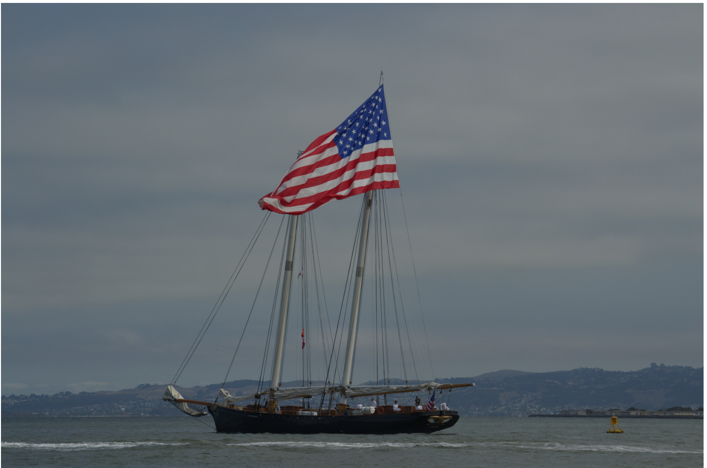
"America", a replica of the original winner.

Team Oracle USA sailed well and climbed up out of a 1 to 8 hole to win the series. The races