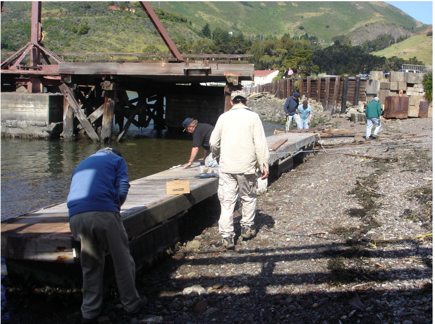
PYC members renovating one of the marina's dock fingers.