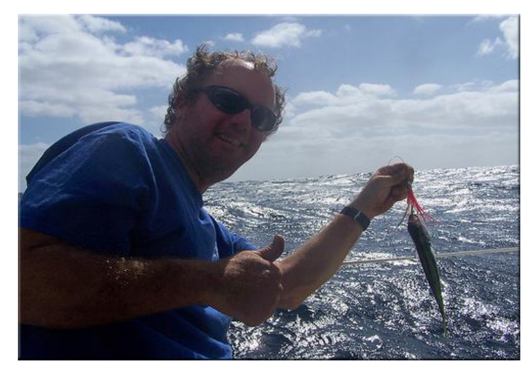
We caught a bunch of these little guys that we threw back to get bigger...

We were then able to secure a slip in the municipal marina that is quite inexpensive while we worked on a few projects and loaded up the Piper with as much beer and food as we could find room for.