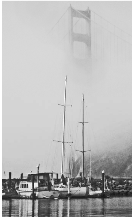
Sandpiper cont. from pg. 1...

As your life takes you to new places, please keep us updated with your new