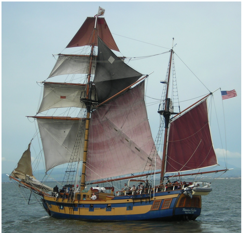
The "Hawaiian Chieftain" visits the Bay.